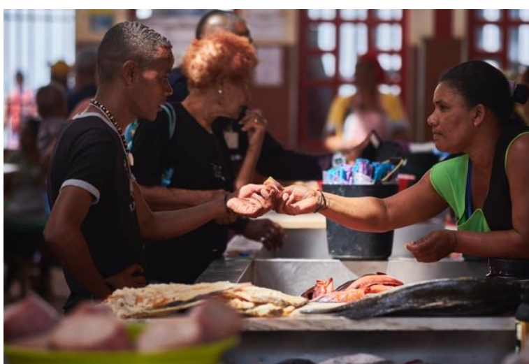
A fish seller receives money from a buyer in the Mindelo market (Cape Verde).

The investment programme accounts for a large share of the financing needs of sector. These include the construction of infrastructures for aquaculture and for the processing and marketing of fishery and aquaculture products. The total amount of domestic and external financing already obtained for fisheries and aquaculture for the period 2015-2025 is estimated at CFAF 10,431,838,000. On this basis, the financing needs for the sector for the period 2015-2025 were estimated at CFAF 53,016,662,000, or 83.5 percent of total requirements. This financing gap will need to be mobilized from the private sector and the country’s TFPs to give the expected results a chance of being achieved.