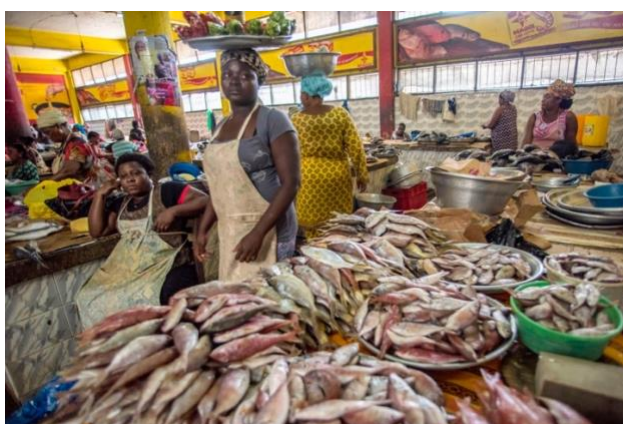
© FAO / Cristina Aldehuela. Women at the fish area inside the Kaneshie market in Accra (Ghana).

The total cost of the strategic programmes directly related to the fisheries and aquaculture sector is estimated at CFAF 12.032 billion , or 0.8 percent of the total cost of the Plan of Action ( see table 18 ). The implementation of other strategic programmes could also involve fishing and aquaculture communities; but a lack of precise information made it impossible to estimate the share of the costs of these programmes.