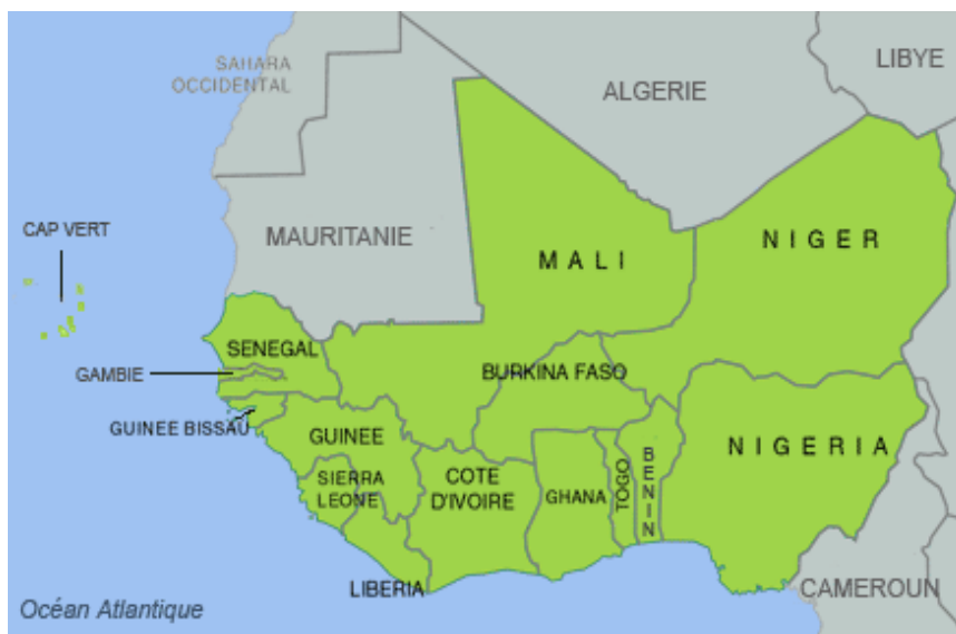
Figure 1: Map of West Africa (ECOWAS Member States and Mauritania)

With a very long maritime coastline of 67,069 kilometres and an Exclusive Economic Zone (EEZ) totalling more than 2 million km 2 , the coastal countries of West Africa (comprising ECOWAS members and Mauritania) benefit from two large marine ecosystems which are among the most productive fisheries in the world: the Canary Current Large Marine Ecosystem and the Guinea Current Large Marine Ecosystem.