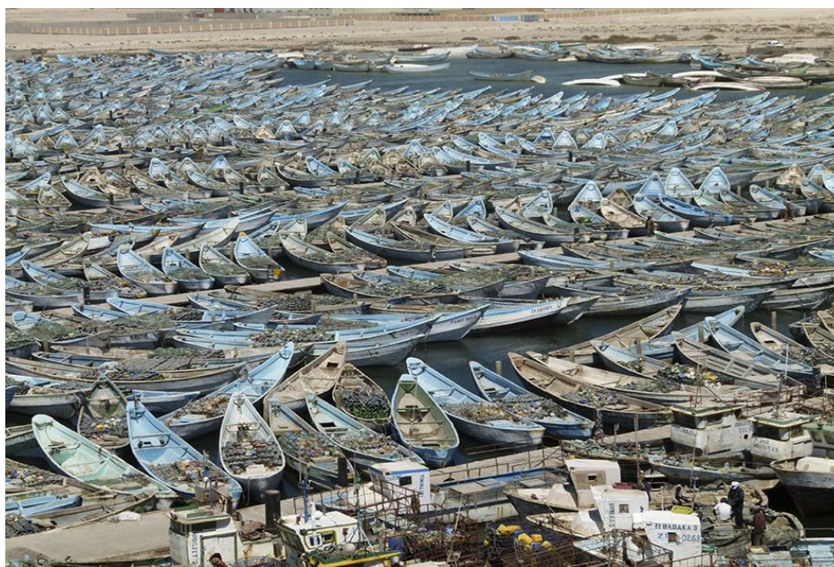
Small scale family fishing boats in the port in Nouadhibou (Mauritania).

In several ECOWAS countries, the national supply of advisory support and capacity building for producers, particularly the human resources of the State institutions represented by the central fisheries administration and deconcentrated services, remains insufficient relative to real needs. Technical staff in the deconcentrated services of the line ministry that supervises actors in the field is globally insufficient, with just a few agents having the required skills in fisheries and aquaculture. The case of Ghana's Fisheries Commission is a good illustration of the situation in all West African countries (see box 1).