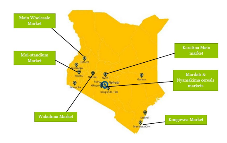
Figure 1: Map of study regions/markets

Findings are reported as average weekly and monthly wholesale and retail prices (KES/kg¹) for the five food commodities across the six regions, including the combined² national averages, per variety (where applicable) and per region. The report also describes the weekly changes in prices along and across the regions (price trends) within the month. Further, the sources of these key food commodities, their availability, and traders' adaptations to the effects of COVID 19 pandemic are discussed.