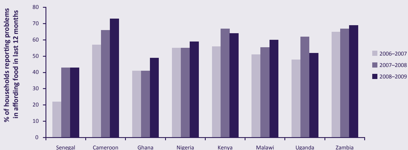
Figure 2—Trends in self-reported food insecurity in Sub-Saharan Africa